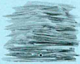
Office Paper & Junk Mail