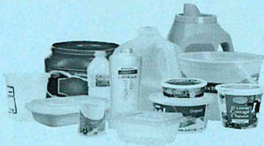
Plastic Jugs/Bottles/Household Plastics